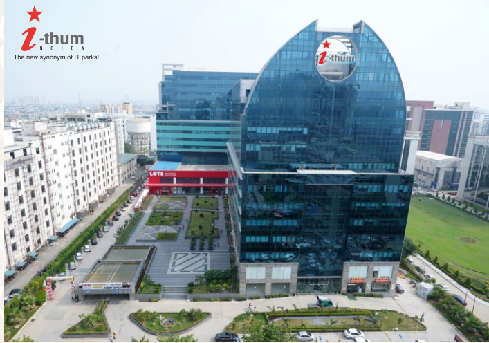
IT/ITeS / COMMERCIAL | Sector 62, Noida