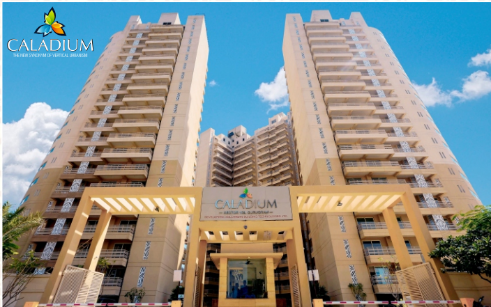
Sector 109, Gurugram | 3 & 4 BHK Apartments & Penthouses