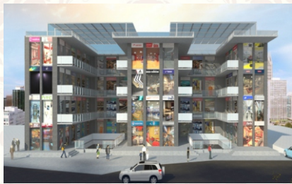
Delta City Centre SHOPPING CENTER Located at Sector Delta-1, Greater Noida