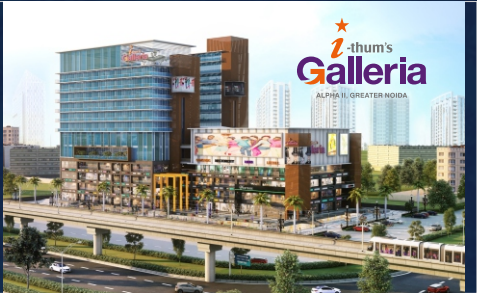
Alpha II, Greater Noida