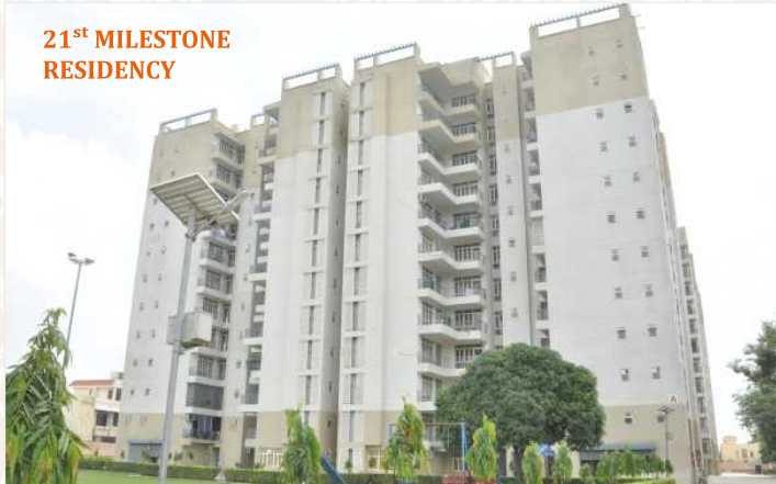
Rajnagar Ghaziabad | 2 & 3 BHK Apartments