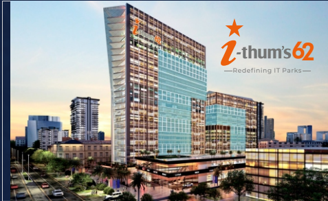
Sector 62, Noida