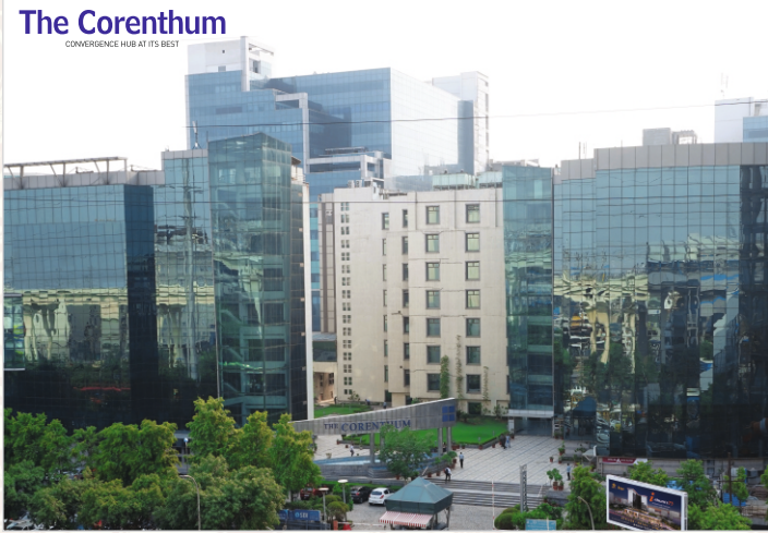
CORPORATE PARK | Sector 62, Noida