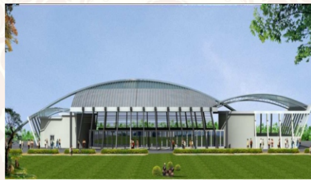
Ice Skating Rink & Indoor Stadium STADIUM Located at Raipur, Dehradun, Uttarakhand