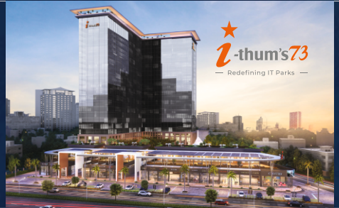
Sector 73, Noida